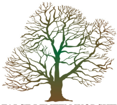
FALSE LENTEN WORSHIP

Oh, yes, we know something about their Lenten observances, how that beginning with their Ash Wednesday and continuing through their Easter ( Ishtar , their veneration of the goddess of fertility ), it is customary for them to deny themselves of candy, tobacco, alcohol, cussing, etc., and abstain from eating meat on Ash Wednesday and during Lent’s six Fridays (though their Knights of Columbus will host fish fries ... catfish, that is, bottom feeders every Friday) only afterward, to resume these indulgences to the flesh ’til after next year’s Fat Tuesday!